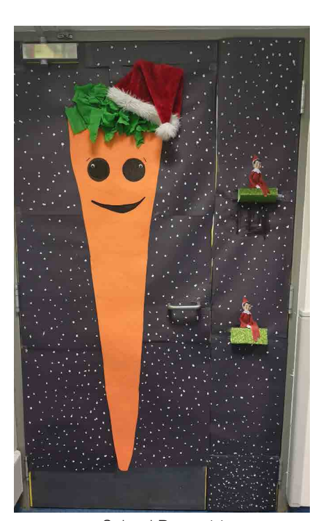
School Room 14