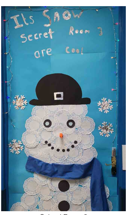
School Room 3