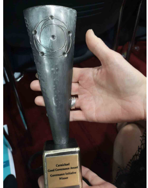
The Good Governance Award

The award was in recognition of the CRC stakeholder engagement programme 'Keeping Connected" which sets out to identify opportunities to get greater impact from Board engagement with key stakeholders. The 'Keeping Connected' agenda item is an interactive presentation which enables clients and the staff to meet and engage with the Board and to communicate in a forum that is welcoming, direct, challenging and responsive. It gives a voice to all corners of the organisation to its highest level and is a great opportunity for real partnership.