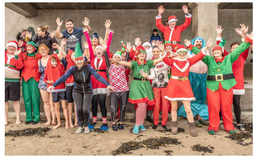
The brave souls from Scoil Mochua and Colin Bell

The event was to raise money for a whole school trip to Lullymore which took place on December 14th. Just over €4, 500 was raised by staff and parents to bring 65 pupils, 70 staff members, 10 parents on 16 buses on a special trip to see Santa at Lullymore.