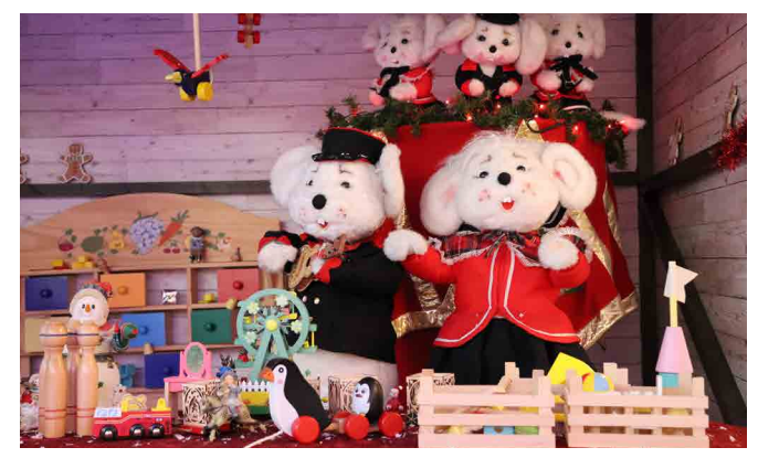
The wonderful winter wonderland created by ATSS