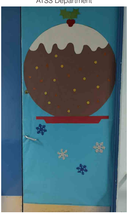
School Staff Room