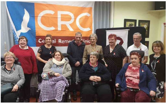
Some of the Firhouse team behind the project