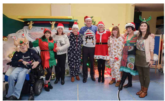
The Accounts Team

There was some serious competition for Best Chrismas theme dress-up but the outright winners were East 17 AKA the Gait Lab!