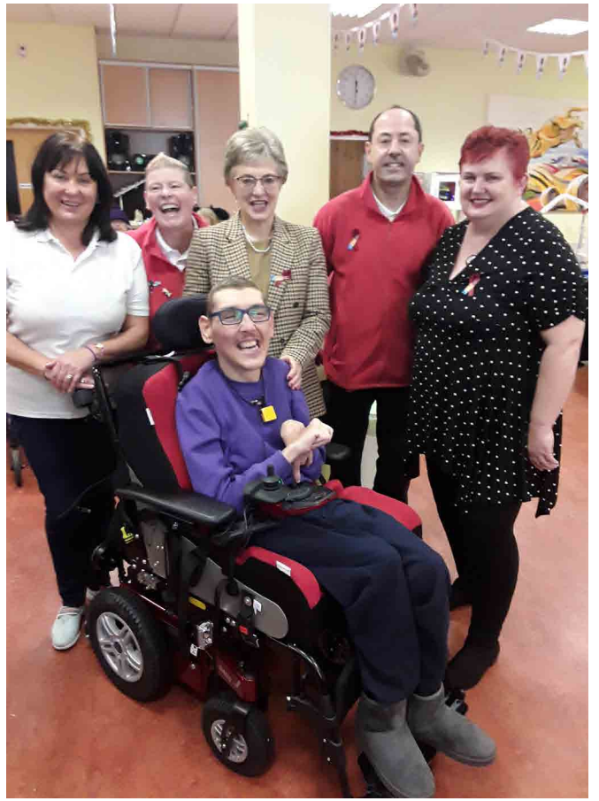
Minister for Children and Youth Affairs, Katherine Zappone, visits Firhouse