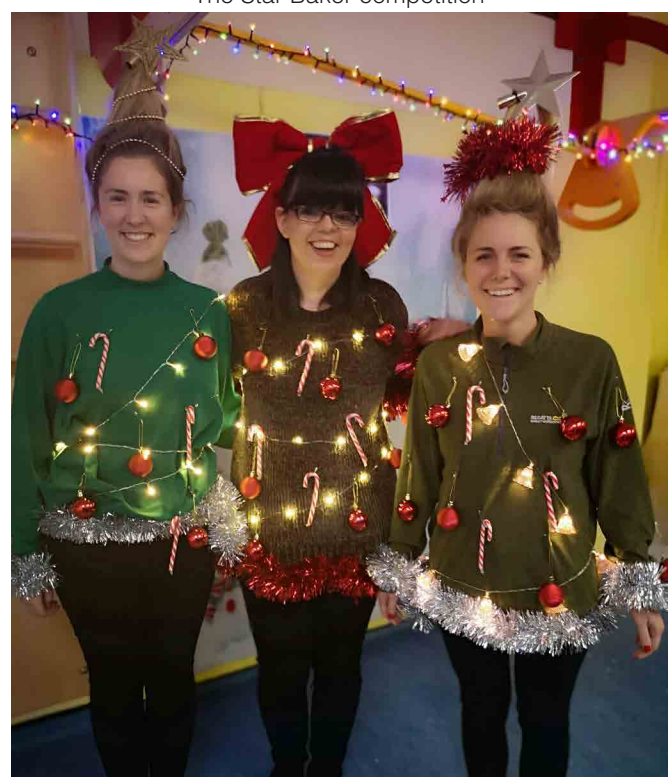
The School Age Team