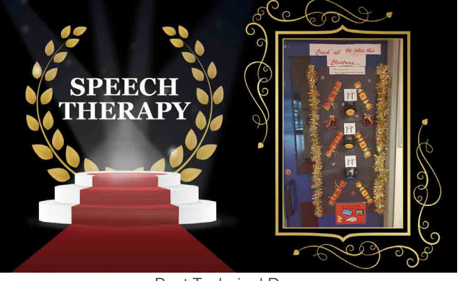
Best Technical Door