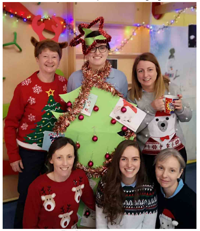
The Physiotherapy team