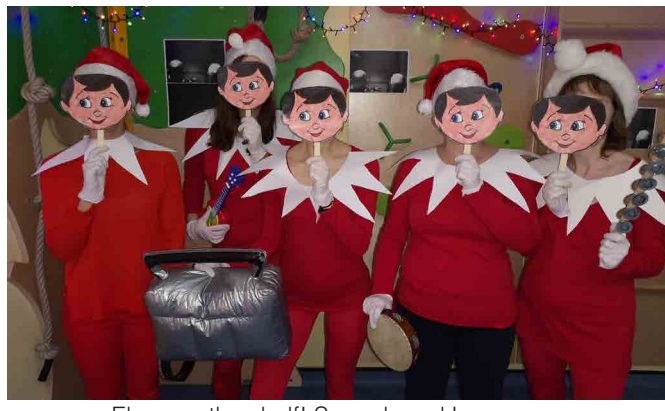
Elves on the shelf! Speech and Language