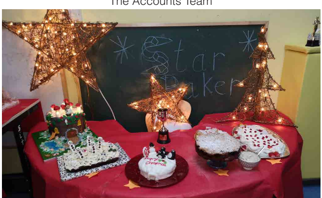
The Star Baker competition