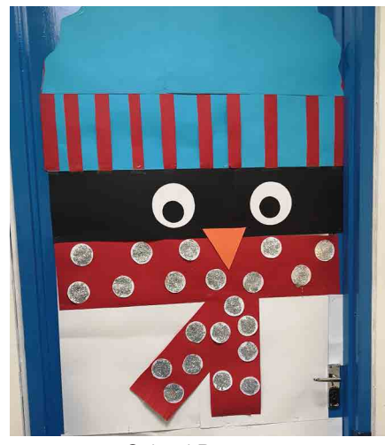
School Room 4