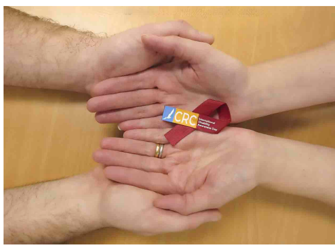
The CRC Ribbon