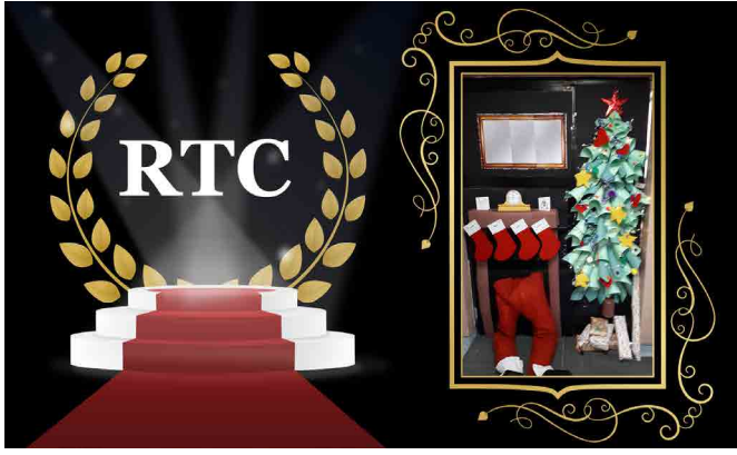
Best Festive Door