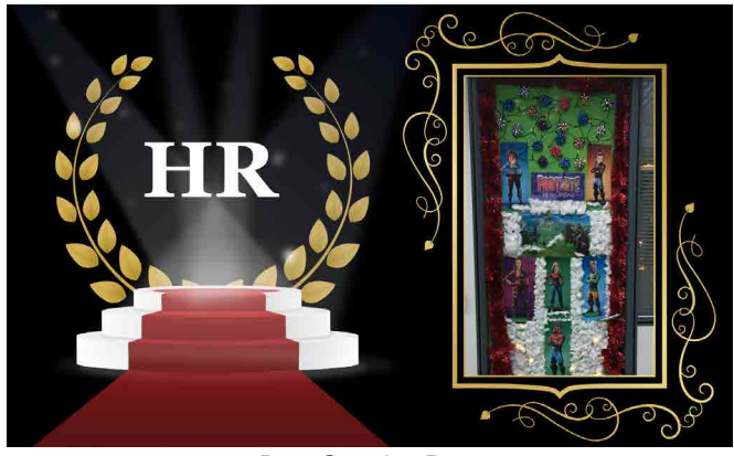
Best Creative Door