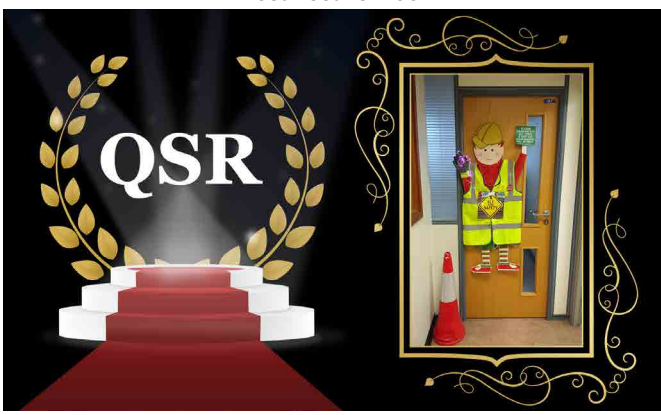
Best Christmas Work Related Door