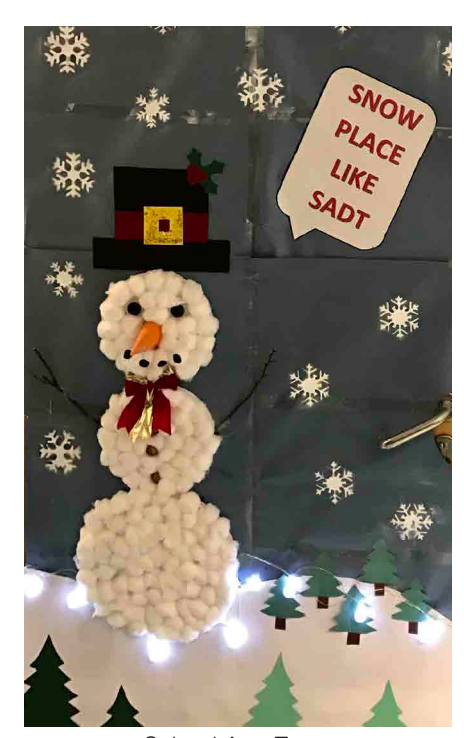
School Age Team