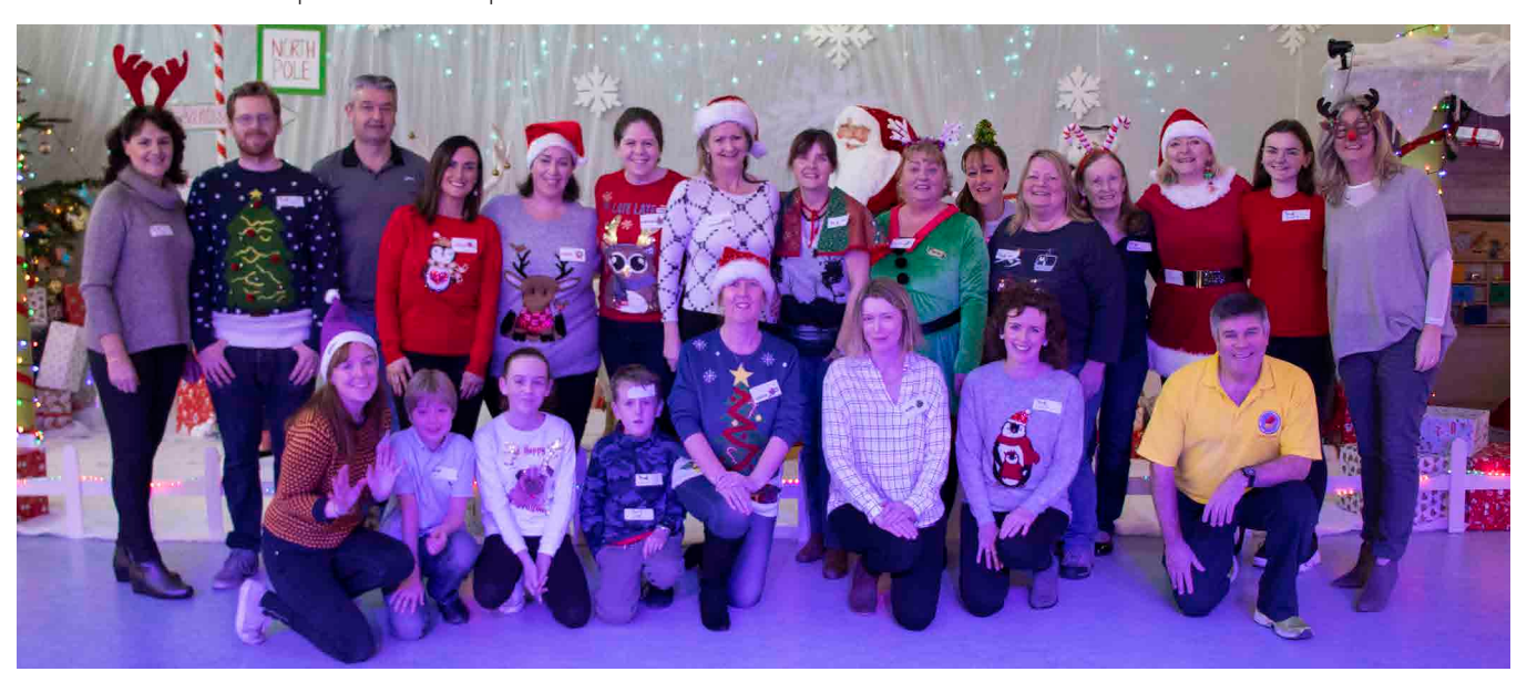
The CRC's team of Elves