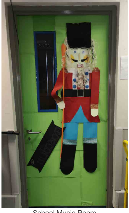
School Music Room