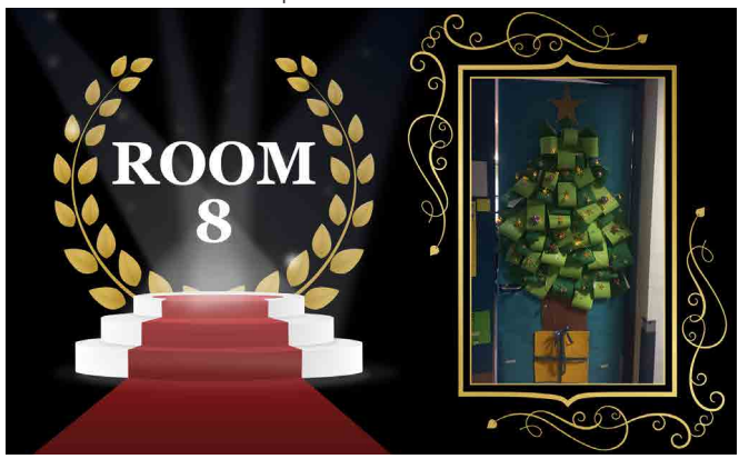
School Spirit of Christmas Award