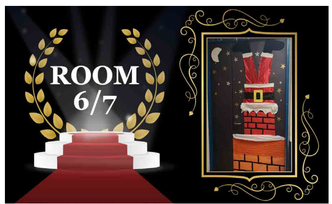
School Spirit of Christmas Award