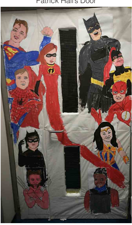
School Room 16