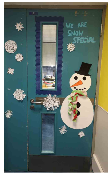
School Resource Room