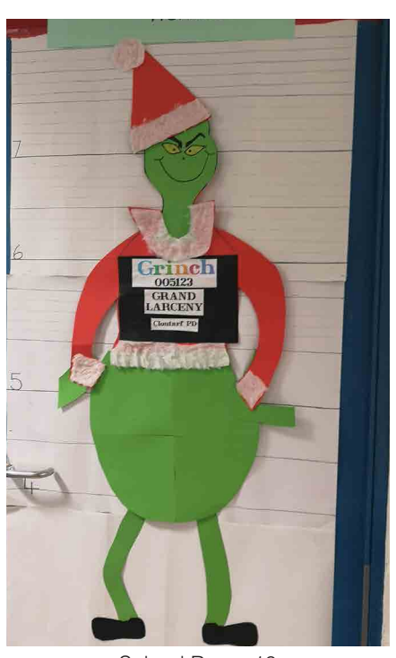
School Room 10

The winners were announced at a prize-giving ceremony at the Christmas Staff Lunch and trophies were awarded to all category winners.