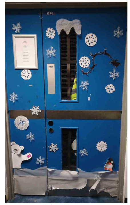
School Room 2