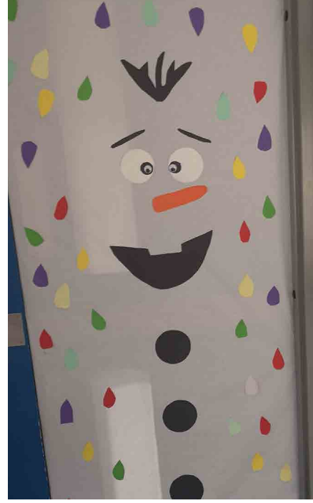
School Room 1