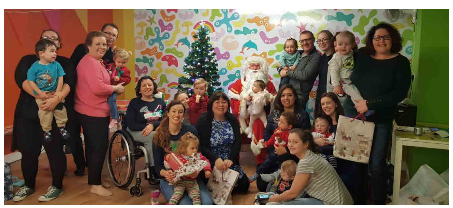
Parent and Toddler Group with Santa

The Parent and Toddler group had a fantastic day out filled with fun and games in Malahide Play Centre. Even Santa Claus stopped by to join in the fun.