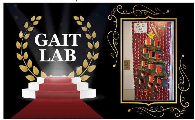
Best Interactive Door