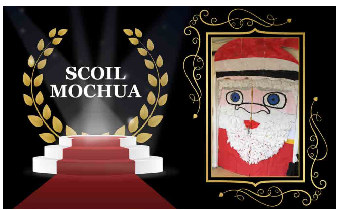
School Spirit of Christmas Award