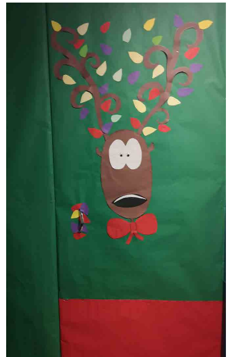
School Room 5